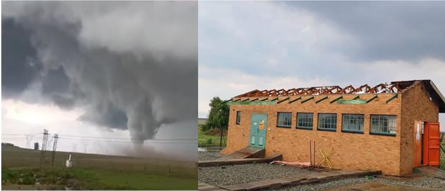
Figure 3: Images from the Lekwa local municipality, Mpumalanga

For the remainder of the week, partly cloudy and warm conditions will persist for most parts of the country with hot to very hot conditions expected to be over the south-western areas of the country. Isolated to scattered showers and thundershowers/thunderstorms will be confined to the central and eastern parts (figure 4) with no severe weather warnings issued yet.