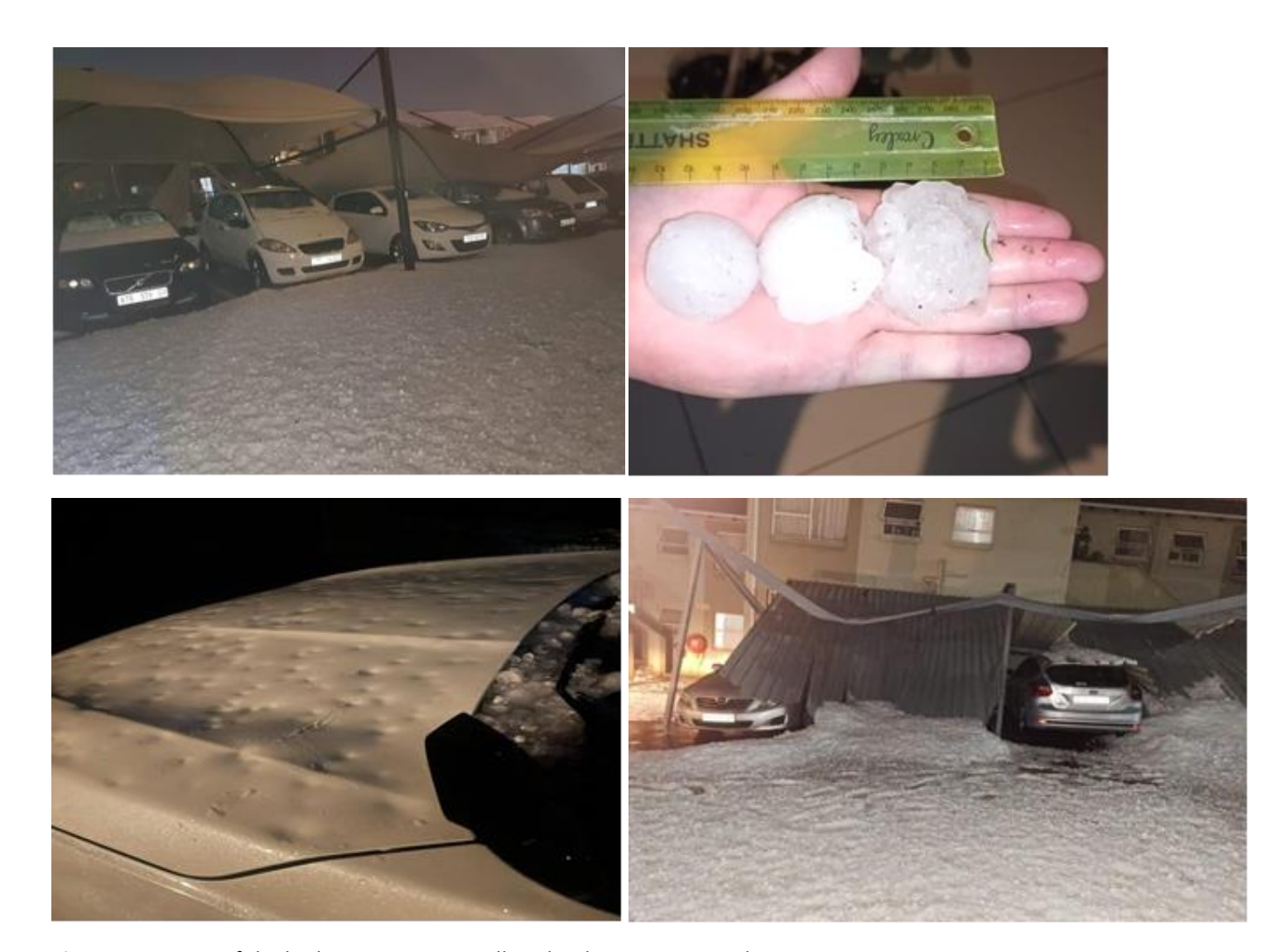
Figure 2: Images of the hail in Gauteng as well as the damage it caused