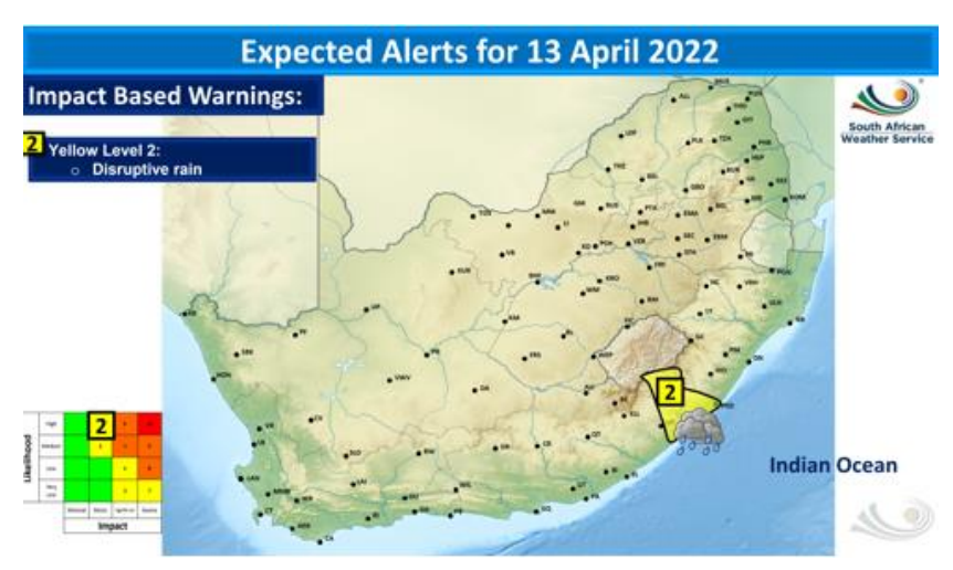
Figure 1: Impact-based (IMP-B) warnings for today.