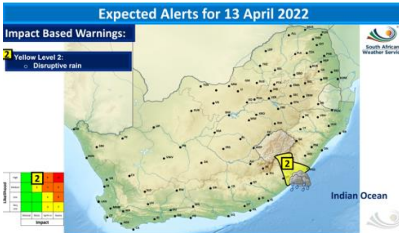
Figure 1: Impact-based (IMP-B) warnings for today.