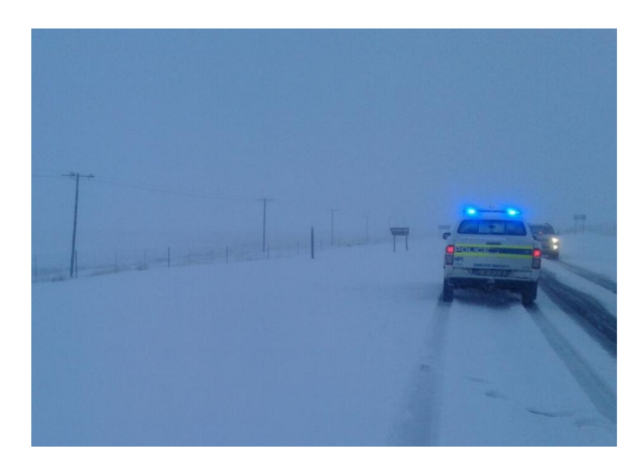
Figure 1: Eastern Cape snowfall this morning. Many roads and mountain passes are closed as snowfalls persist today over the province.