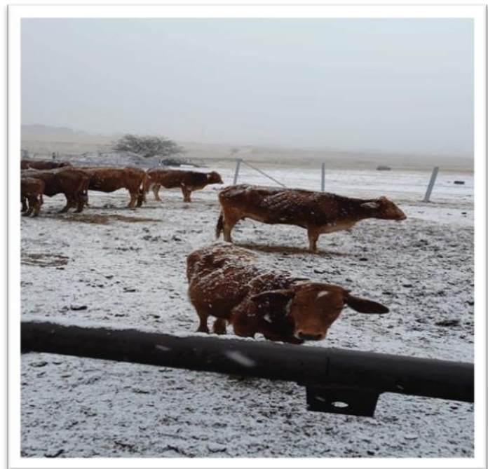
Figure 2: Snow reported in Heidelberg

A cold front caused a significant drop in temperatures over Gauteng today, Monday, 10 July 2023. The maximum temperatures are expected to reach 13°C in the northern areas of Gauteng, with minimum temperatures recorded to have met criteria for snowy conditions. Snow was observed over areas in the south, such as Soweto, Alberton and Roodepoort.