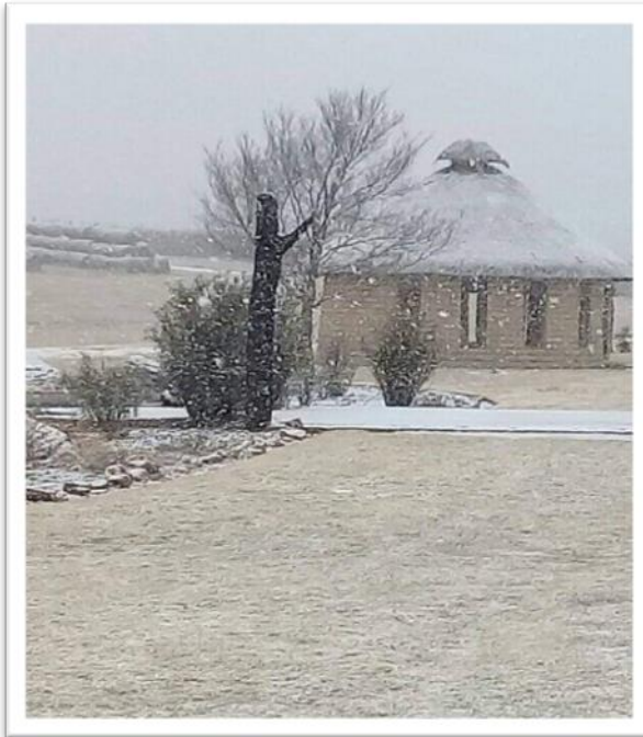
Figure 1: Snow reported in Heidelberg